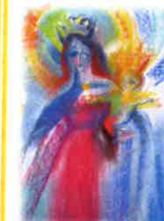
Feast Day: 24th May