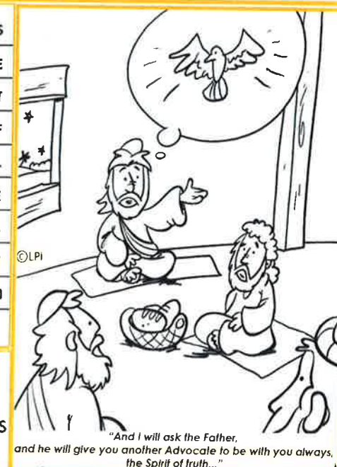
"And I will ask the Father, and he will give you another Advocate to be with you always, the Spirit of truth..."